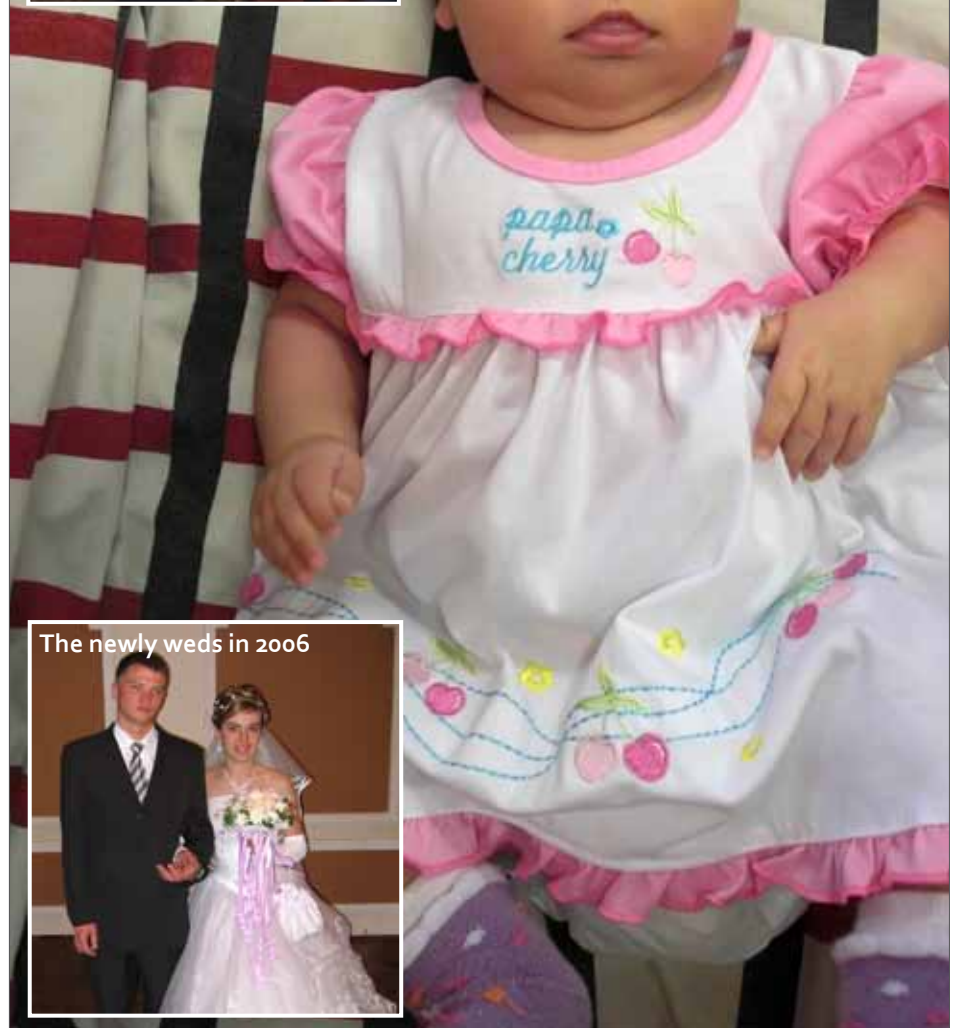
The newly weds in 2006